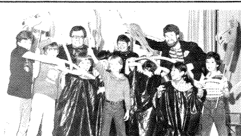
A few antibodies, germs and penicillin taking a well deserved bow.